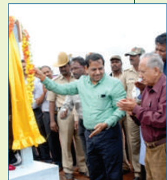
Tree Plantation, ODF Inaugurated