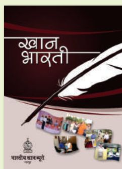
Title: Khan Bharati- Hindi Souvenir