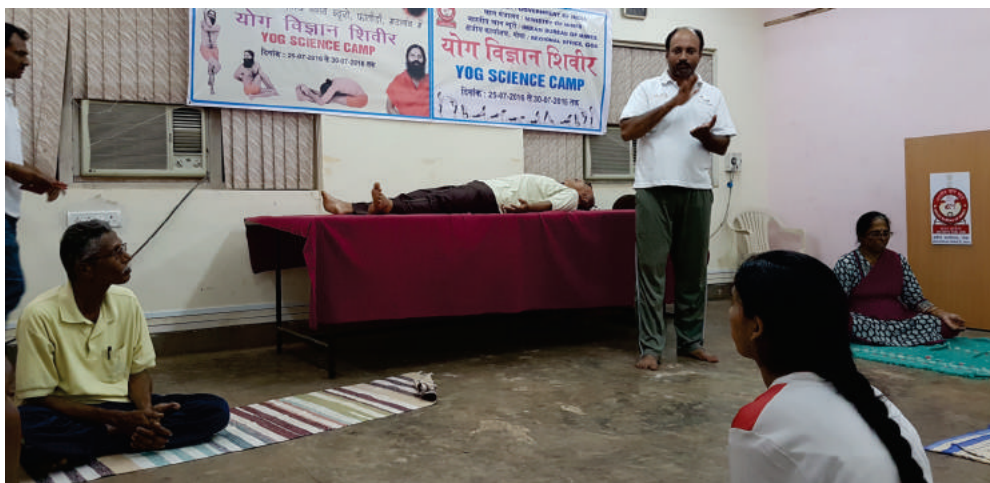
The IBM personnel attend the Yoga Science camp held at the IBM Goa office.