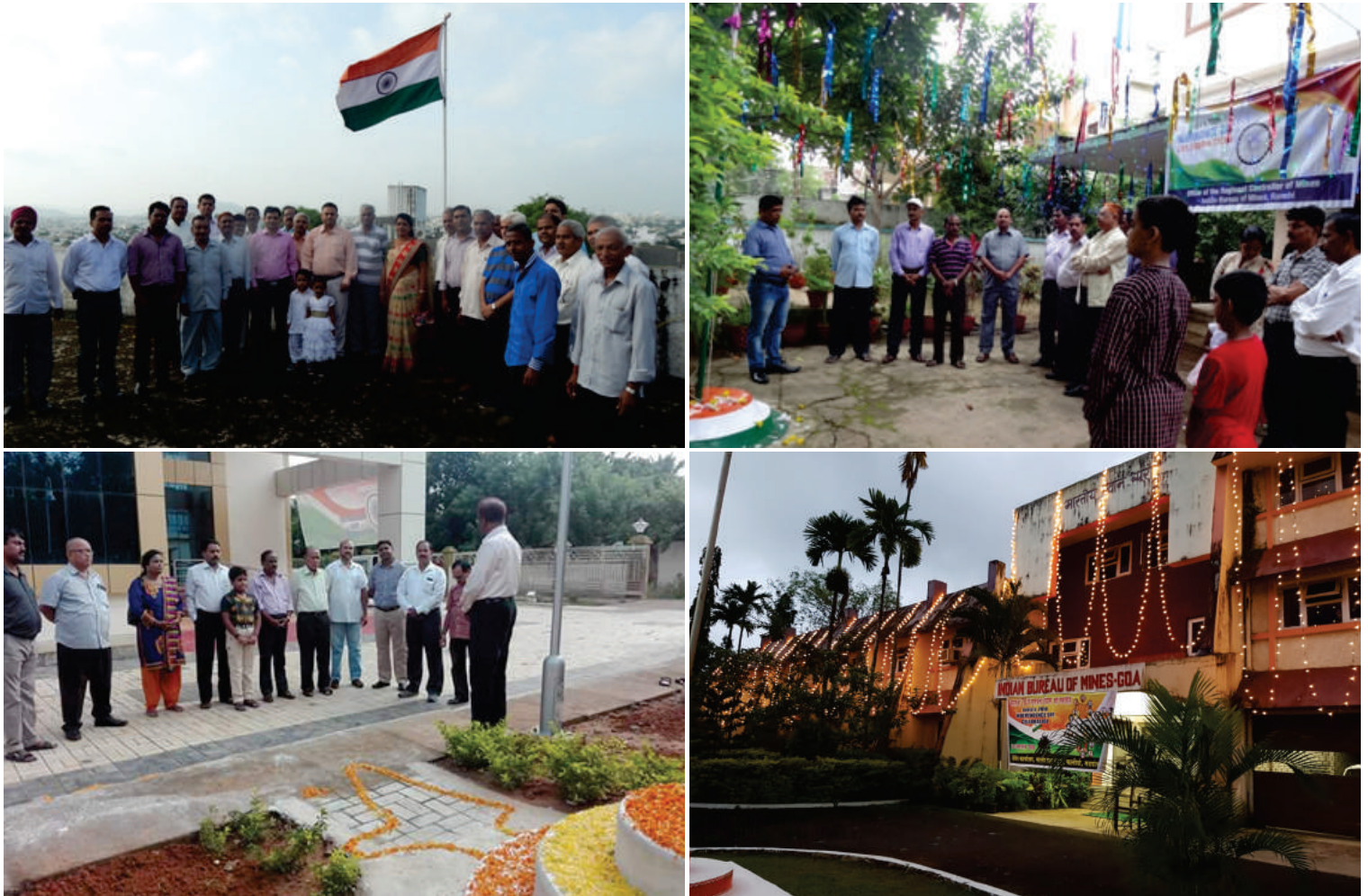
(Clockwise) The officers and the staff at the flag hoisting ceremony held at Udaipur office. The IBM personnel at the flag hoisting programme at Ranchi office. The Goa office of IBM lit up for the I-day celebrations. The officials attending flag hoisting function at Bhubaneswar office.