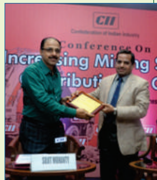
CG attends CII meet