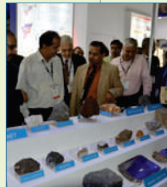
Secretary, CG attend Mining Mazma 2016