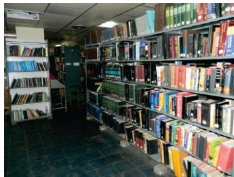
Central Library, IBM, Nagpur.

The Committee recommended important publications like Metal Bulletins, World Metal Statistics, Minerals and Metals Review, Resources Policy, All India Reporter, International Journal of Mineral Processing,