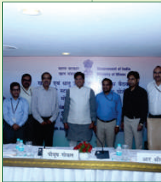
Online system for Star rating launched