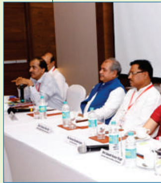
National Conclave of Mines & Minerals held