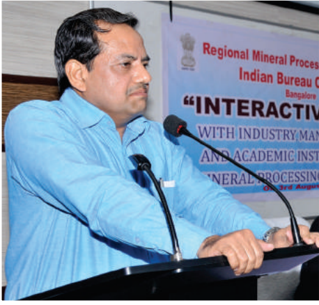
IBM Holds Interaction With Industry, Academic Institutions